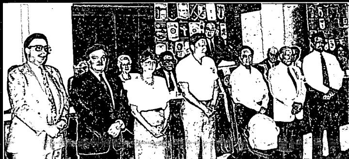
New Directors sworn in