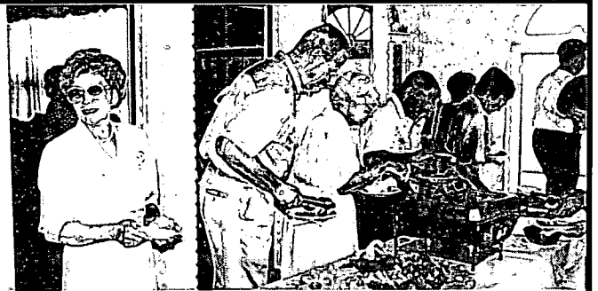
Windemere Rotary party